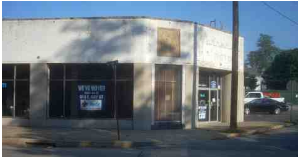
The building at the corner of E. Gay Street and Patton Alley. The plaque is above the door in the center of the picture.