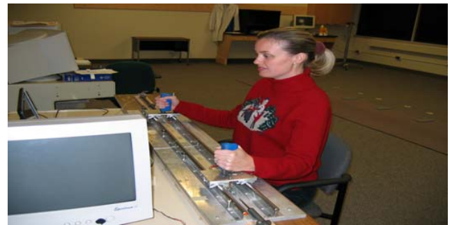
Fig. (1). Bimanual Linear Slide.

An auditory metronome (NCH Swift Sound Tone Generator, version 2.01) provided pacing information for the bimanual tasks. Under visual deprivation conditions, lights were extinguished and computer monitors were covered to achieve total darkness in the room, so that participants' view of their arms was completely eliminated. In auditory deprivation conditions, a white-noise masking stimulus (NCH Swift Sound Tone Generator, version 2.01) was delivered to the subject's ears via supra-aural headphones (Optimum Pro-155 stereo headphones) so that audition about performance from the linear slides was masked.