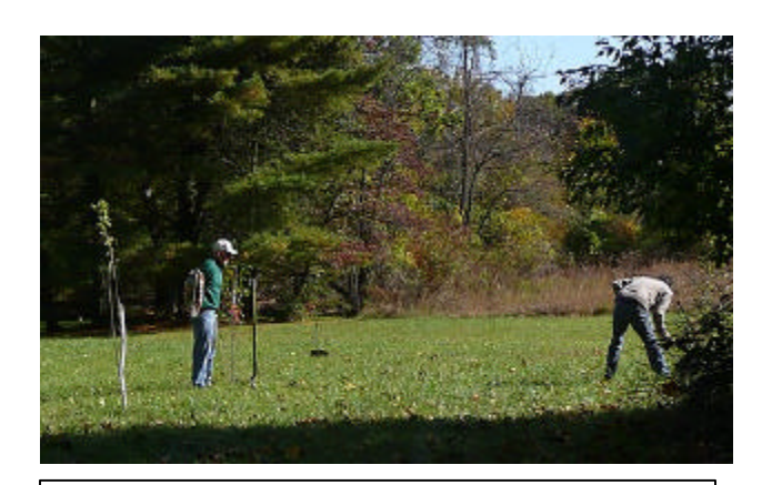
Bruce Arnold, friend of the GNA, with another tree planter

Many thanks to all the volunteers who came to help out. We cleaned up some trash, closed off trails, and removed lots of invasive plants like oriental bittersweet. 32 new trees were planted as well. Below are some snapshots from the morning.