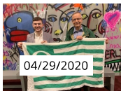
04/29/2020 ANTHROPOLOGY MUSEUM'S "EARTH DAY AT 50" EXHIBIT SHIFTS TO FALL