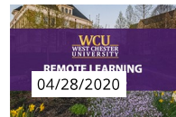
04/28/2020 WORLD-RENOWNED MUSICIANS ALIGN WITH WCU STUDENTS