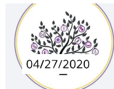
04/27/2020 RESEARCH DAY APRIL 27